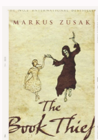
The Book Thief by Markus Zusak