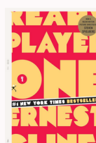
Ready Player One by Ernest Cline