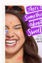
There's Something about Sweetie by Sandhya Menon

As you read, (1) consider the development of the main character and how their experiences help them understand the world and/or themselves in a new way; and (2) annotate, noting any passages you find interesting, significant, or memorable--for any reason at all. (Your annotations will not be graded, but they will help you as you begin to work with the book in class. Here is a document to help you keep track of things. It's only accessible by NISD email addresses.)