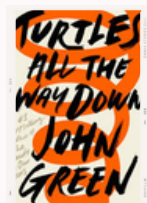
Turtles All the Way Down by John Green

Students entering Advanced English I are required to read ONE of the books below in preparation for the course. Each image below represents a narrative focusing on a character whose experiences lead to maturity and/or understanding the world in a new way. Not every book is right for every student, so please click on each image to read a description and find the book that is best suited to your tastes, interests, and values. Feel free to do further research on the book to confirm your choice is the best one for you.